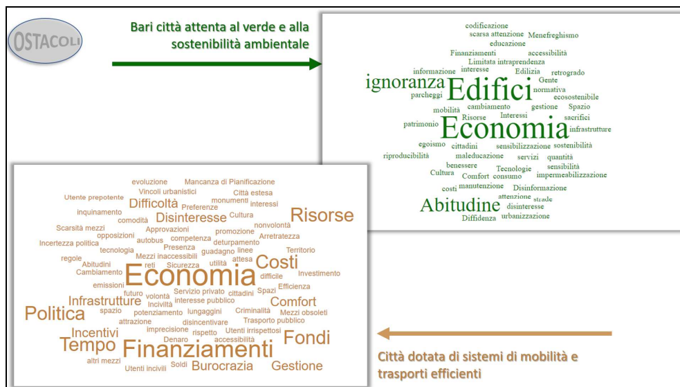
Figure 6 – Wordcloud of obstacles in university experimentation - excerpt in Italian (Santoro, et al. 2020)

The use of a collective visualization tool such as concept mapping usefully supported idea generation. The tool also allowed a reflection on the relationships existing between the various problems - which are not shown in the figure because it would have been illegible. It also allowed further stages of exchange and collective refinement of the statements, for a process of iterated self-learning that is very useful in generating high-level knowledge (Lichtenstein 2000, Allee 2009). However, the very visual appearance of figure 4 shows clear problems of synthesis and unmanageability of the reflections, which paradoxically grow with the (desirable) increase in the reflections themselves. To deal with these problems it was decided to synthesize the statements using keywords, subsequently collected by frequency and redundancy via wordcloud. This process was reiterated for all 8 neighborhoods of Taranto and provided to the municipality for subsequent deliberations. This case can show that the need to preserve the complex richness of statements, towards a more effectively knowledge-based decision-making process, risks being challenged by the needs for readable synthesis and manageability of the results.