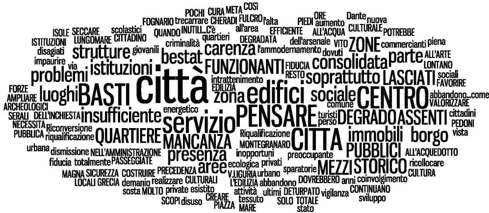
Figure 5 – Wordclouds of problems in Taranto process - original Italian excerpts (Camarda 2018)

limits. With the aim of more effectively managing the need for synthesis and refinement of results in real time, the interactive process was supported by the use of concept maps and wordclouds (Cui et al. 2010, Heft 2013). The process involved approximately 350 participants, divided into 8 sessions carried out throughout the city's neighborhoods. It was limited only to the stages of identifying problems (critique) and generating desirable future images (fantasy) for the development of the city. The output required by the official research contract was the provision of concepts and keywords on which the municipal administration would subsequently develop strategy schemes. An example of the session relating to the compact city, i.e. the Taranto shopping centre, is shown with the concept maps (figure 4) and the synthetic wordcloud (figure 5) of the problems cited by the participants.