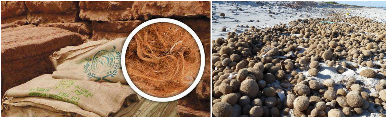
Fig. 5 (left): Thermal insulation from used coffee or cocoa sacks made from jute fibre. Source: mb-netzwerk GmbH, Portal Ökologisch Bauen: Jutedämmung, Wärmedämmung aus Jute. URL: https://www.oekologisch-bauen.info/baustoffe/naturdaemmstoffe/jutedaemmung/, [Accessed: 14.06.2023]. Fig. 6 (right): Washed-up Neptune balls on a Mediterranean beach. Source: Neptu GmbH: Was ist NeptuTherm®, woher kommt und wie entsteht es? URL: http://neptusan.com/was-ist-neptutherm.html, [Accessed: 14.06.2023]

Jute insulation boards are made from old cocoa or coffee sacks that were previously used to transport goods to Germany and may not be used again for the same purpose. 20 They have a thermal conductivity of 0.038 to 0.041 W/(mK) and are classified as normally flammable (building material class B2). Up to 10 % biopolymeric support fibres are added for stabilisation and up to 5 % soda ash for fire protection. 21 The soda is already used for cleaning the shredded fibres. The insulation boards can be installed very easily and quickly by the user without special protective clothing. The boards can be assembled by the customer or delivered prefabricated. Like many natural insulating materials, jute insulation boards have a high absorption capacity and can compensate moisture well due to this property. After absorbing moisture, they do not lose their function as long as the moisture can be released again. 22 In addition, they offer particularly good heat protection in summer.