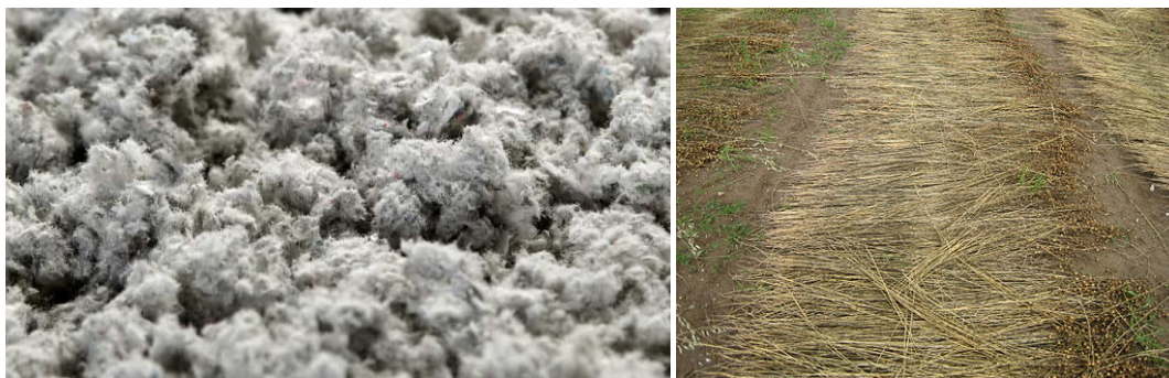
Fig. 3 (left): Cellulose insulation. Fig. 4 (right): Flax dew roasting in the field. During dew roasting, undesirable substances are broken down by bacteria and fungi.

Flax insulation boards or flax fleece consist of short fibres of the flax plant. These short fibres are a by-product of the textile industry. The cultivation of flax is in sharp decline in Germany, but is being further expanded in neighbouring countries. The cultivation and harvesting of flax are labour-intensive, but almost all parts of the plant can be processed into different products.