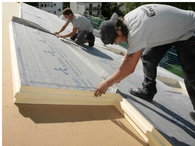
Fig. 7: Installation of PU rigid foam panels as above-rafter insulation. Source: Baustoffwissen, RM Handelsmedien GmbH & Co. KG: Dämmstoffe, Einsatzbereiche von PU-Hartschaum. URL: https://www.baustoffwissen.de/baustoffe/baustoffknowhow/daemmstoffe/pu-hartschaum-polyurethan-daemmstoff-platten-einsatzbereiche-dach-boden-wand-wdvs-brandriegel-sandwich-elemente/ [Accessed: 14.06.2023]

PU insulation boards made of slab stock foam or polyurethane rigid foam boards are petroleum-based rot proof products that are created in a chemical reaction, with the help of the blowing agent pentane. HCFC-141b was also used as a blowing agent, but has been banned in Germany since 2004. Furthermore, the Ecological Building Material Lexicon (Ökologisches Baustofflexikon) lists many other formerly and currently used blowing agents, flame retardants and additives, some of which have been banned over time and then replaced by alternatives. Polyurethane rigid foam panels are considered harmless to health when installed, but during production employees come into contact with numerous toxic substances. Subsequent outgassing of the blowing agents can also be assumed. In addition, the plastic may only be disposed of in small quantities and is therefore incinerated, producing toxic hydrochloric acid. The insulation value of rigid Polyurethane foam boards with a thermal conductivity of 0.025 to 0.030 W/(mK) is particularly good. In addition, depending on the product, building material class B2 (normal flammability) or B1 (low flammability) is possible.