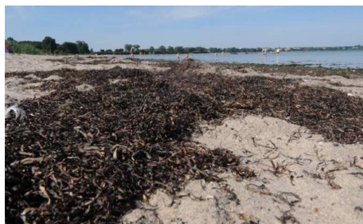
Fig. 2: Accumulated seaweed in the Baltic Sea.

In addition to the flawless processing of renewable raw materials into building materials while avoiding harmful and/or synthetic substances, the efficient use of these raw materials is particularly relevant in protecting our ecosystems. Even renewable raw materials are not available in unlimited quantities. The raw material base of bio-based insulation materials consists, for example, of wood chips, flax fibres, cellulose flakes, straw, seaweed or cork scrap. These are residual materials and by-products from other material flows. Flax short fibres, for example, are a by-product of the textile industry. Seaweed accumulated on the coast is often removed at great expense and disposed of in landfills, as it is considered a nuisance on the beaches, which are mostly used for tourism, and is regarded as waste. However, these residual materials, which accumulate anyway, can be further processed into pressure-resistant boards, flexible mats, blow-in or plug-in insulation and used for building insulation.