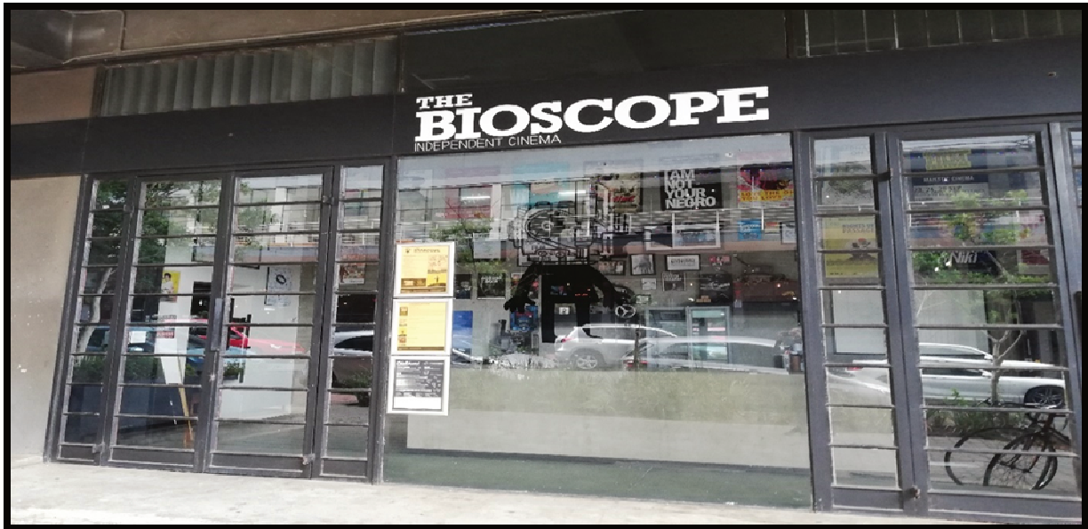
Figure 7: The Bioscope independent cinema.

The bioscope pictured in Figure 7 is able to bring together people from all walks of life and from different kinds of economic status'. There is also an urban sculpture park ; which has enhanced social interaction of visitors and residents in the precinct.