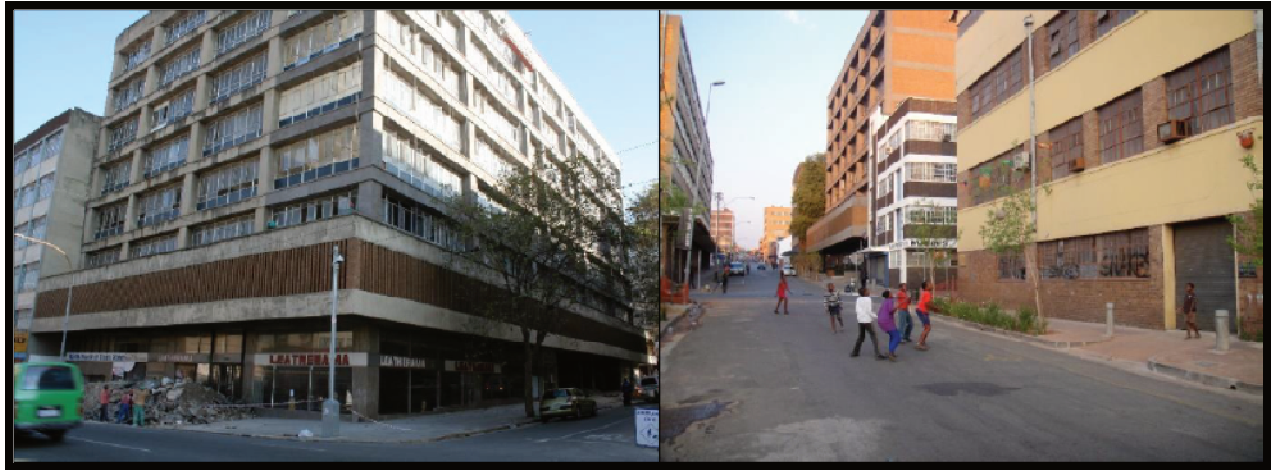
Figure 3: Left, Main Street life before renovations and right, fox street before development. (Source Burgess, 2009 found in Murtagh, 2012)