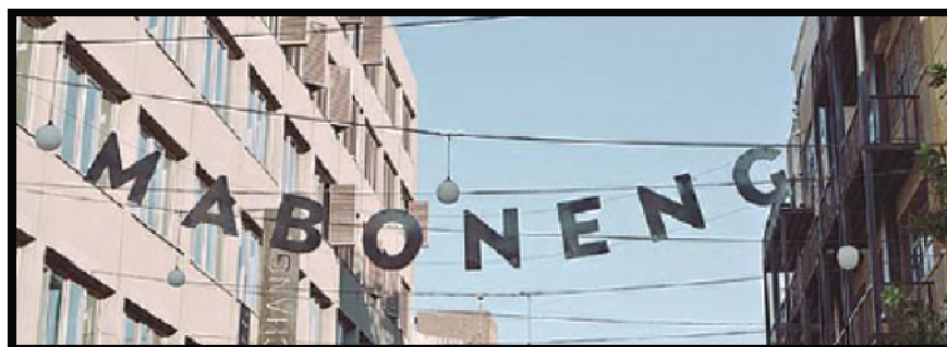
Figure 5:Maboneng Signage.

The naming of a restaurant after Miriam Makeba’s song who is a music icon who lived and performed during the struggle is in itself a great marketing tool because it has over the years attracted most residents in to the building and has attracted more customers (Murray, 2011).