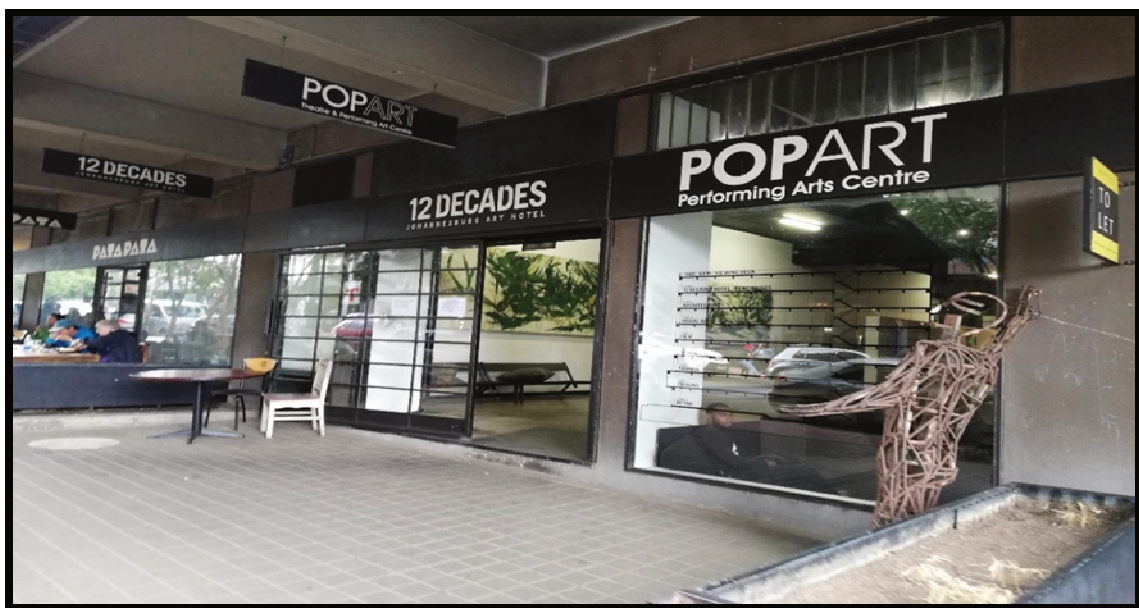
Figure 4: Main Street building after development.

The naming of a restaurant after Miriam Makeba’s song who is a music icon who lived and performed during the struggle is in itself a great marketing tool because it has over the years attracted most residents in to the building and has attracted more customers (Murray, 2011).