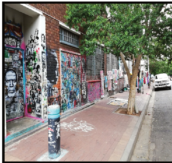
Figure 8: The environment of Maboneng.

The physical environment of the precinct area has improved over the last 10 years with aesthetic space becoming better. Most buildings around the precinct as seen in Figure 7 have got transparent windows which act as the “eyes on the street” and creates a feeling of safety and security (Mashiri, 2017). As seen in Figure 8, there are crafts on the sidewalks, the pavements are in good condition, the area is clean, there is street furniture and graffiti on the walls; these are all things that did not exist 10 years ago.