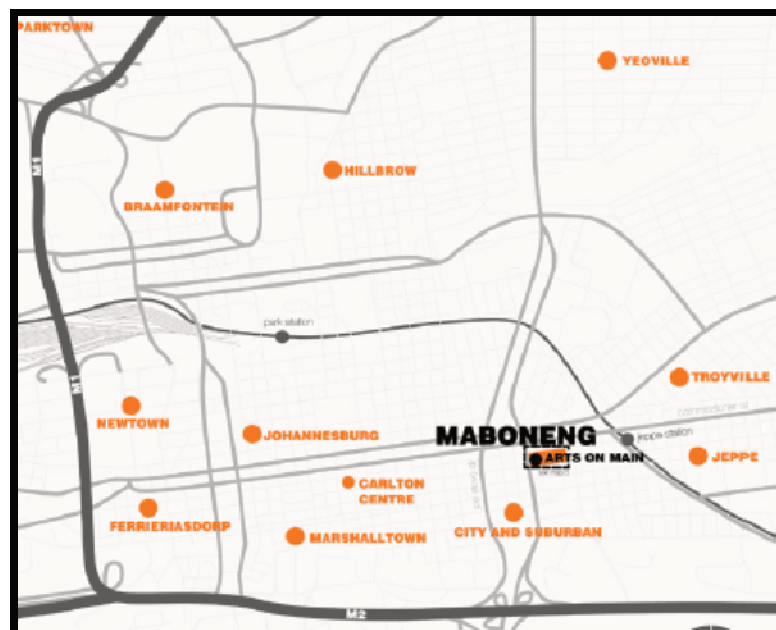
Figure 2: Location of Maboneng Precinct.

Thus as discussed under this section there are various forms of branding, this paper has discussed Afro-branding and Urban branding. The other various forms of branding are illustrated in Figure 1. Thus, all kinds of branding are concerned about the image of the city, attracting people to the city and increasing the competition of the city.