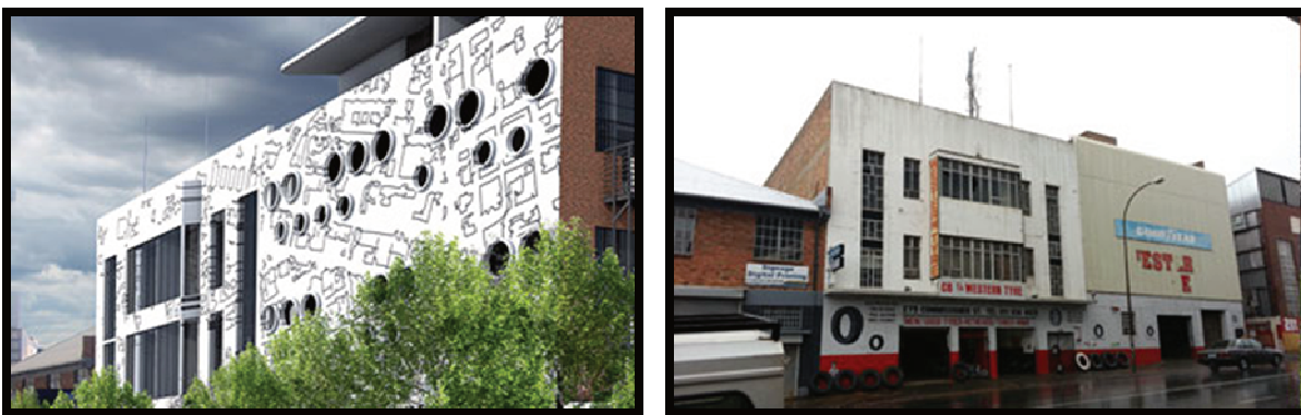
Figure 6: Left, Rocket build after renovation, right, Rocket building before renovation.

When one looks at Maboneng today compared to 10 years ago as seen in Figure 3 and Figure 4, the precinct area has experienced transformation and as highlighted by Interview Respondent A, the precinct area used to be an industrial waste land and Figure 3 illustrates the dullness, derelict, decay condition the area was in approximately 10 years ago before experiencing physical change. Interview Respondent E mentioned that the precinct area has changed in character “most of the old buildings have been renovated, are now in good condition and have different uses. In the precinct area buildings that are derelict are becoming spaces and the area is marked by a lot of art be it painting, sculptures or wall graffiti which give the precinct a distinct feel to it.” Seen in Figure 6 is an example of the rocket factory before renovations on the right hand side and after renovations on the left hand side the building has improved and graffiti has been used as a form of branding to create a lively sense and to attract more people to the building.