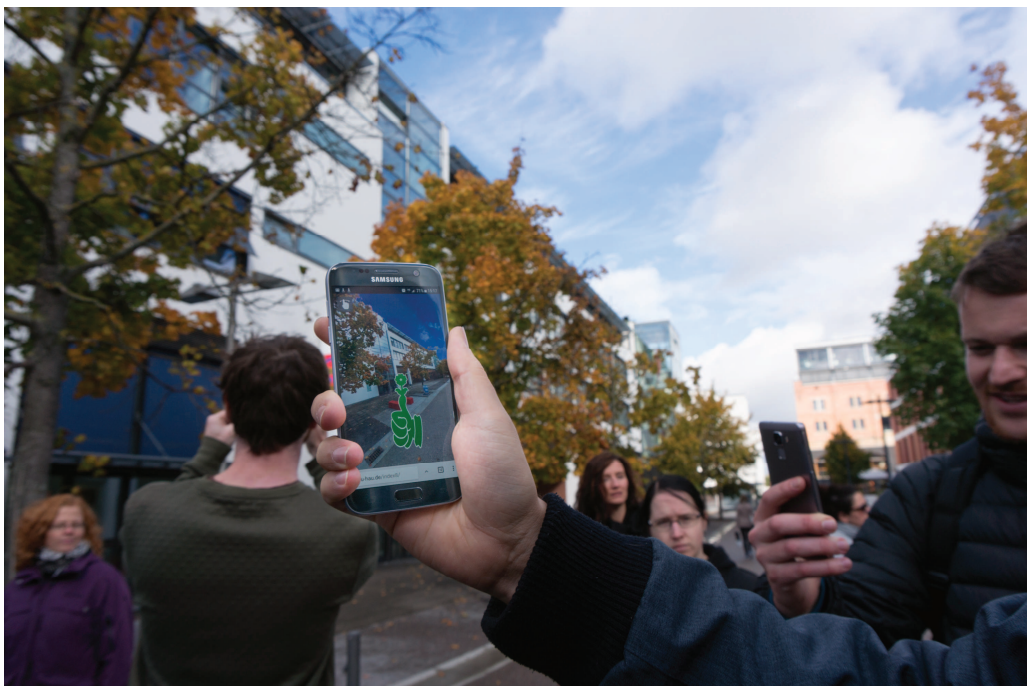
Fig. 3: Virtual city tour prototype enabling citizens to participate in past, present and future urban developments in Ludwigsburg as one of the results of Makeathon 2 (Fraunhofer IAO 2017).