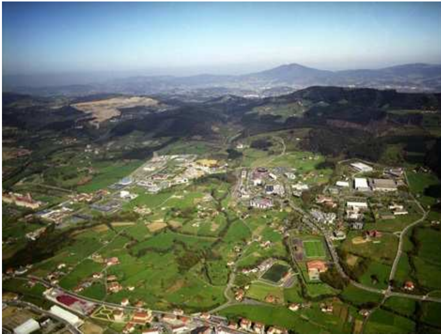
Fig. 1: Aerial view of the PTB