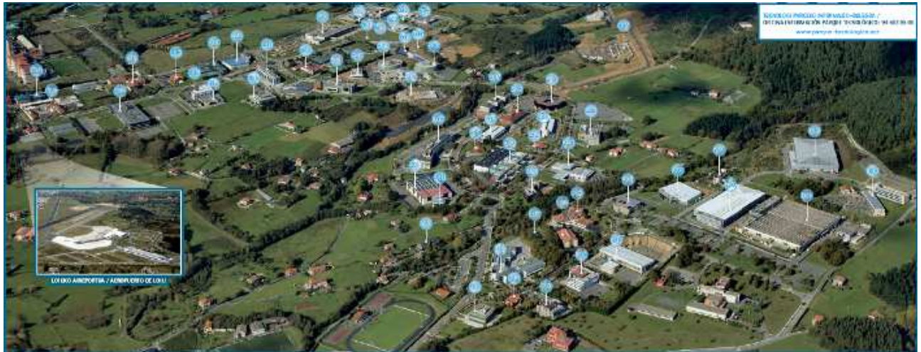
Fig. 2: Location of companies at the PTB