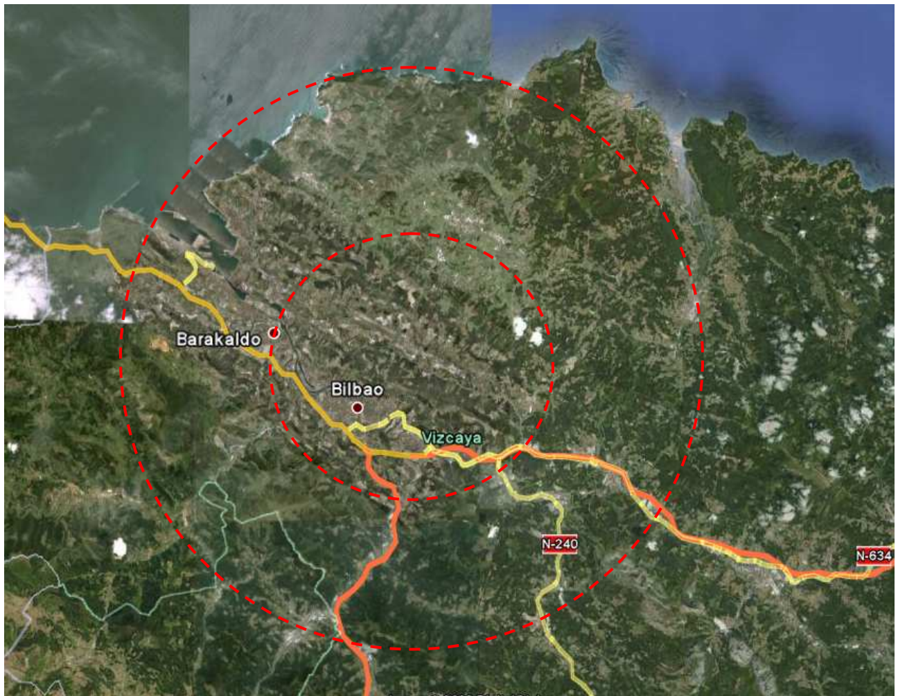
Fig. 4: Distances from the PTB (10 km and 20 km radius)